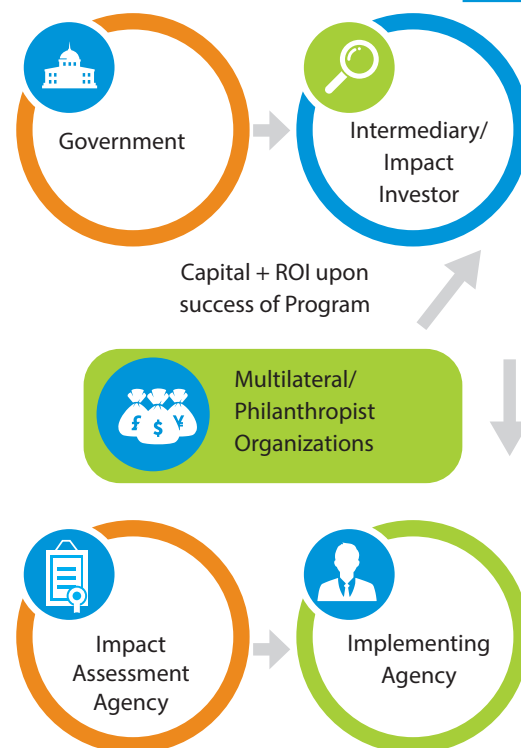
Figure 2: Draft DIB operational structure

however debt/convertible debt based investments have seen a rise recently. This form of debt currently accounts for less than 5 percent 3 of the country's annual VC flows but is growing rapidly with the entry of new players. Nexus Venture Partner's investment of INR 200 4 million in TalentSprint, Unitus Seed Fund's investment in iStar and Acumen's and Insitor's investment of INR 172 5 million via Series A funding in Edubridge are some of the examples of PE/VC activity in the vocational education space. PE/VC fund investments are not just limited to the vanilla TPs, rather multiple facets of the skill development industry benefit from it. For instance, Helion Venture Partners have invested USD 10 6 million as part of Series C funding into the online test preparation platform, Toppr.